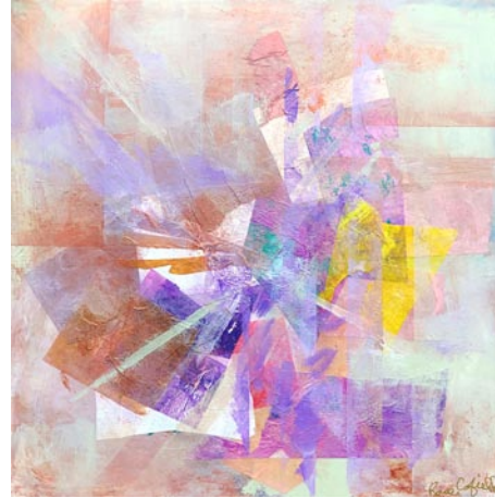
Work by Rose Cofield

Four Corners Art Gallery and Fine Framing , 1263 May River Rd., Historic District, Bluffton. Ongoing - Featuring works by 12 artists with an especially local flavor. The works are in acrylic, oil, mixed media, pen and ink, pottery and wire sculpture. A real treat. We have a fine collection of custom picture frame mouldings and an experienced staff to work with anything from the unusual to the museum treated piece. Hours: Mon.-Fri., 10am-5:30pm & Sat., 11am-2pm. Contact: 843/757-8185.