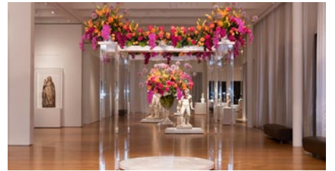
View of previous Art in Bloom