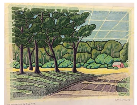
Work by Patrick Edwards

"This exhibition will focus on both the visual artistic images - primarily floral and garden scenes - produce and the thoughts and perceptions - 'nature poetry' - that these nature scenes inspire," says Edwards, who grew up in Iowa and South Dakota. "The works use various types of colored pencils, most notably Prismacolor pencils. I create a template or relief that I then use to emboss the design into the paper before I add the colors."