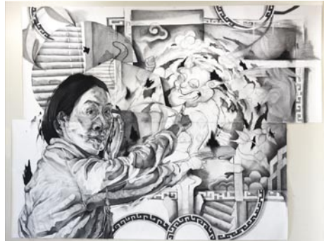
Ming Ying Hong, "The One with the Leopard", Charcoal and graphite on paper, 82.5"x110", 2021

Ming Ying Hong is an interdisciplinary artist born in Guangzhou, China, and currently based in Rhode Island. Her work has been exhibited internationally in spaces such as Zabludowicz Collection in London, UK; CICA Museum, in Gimpo, South Korea; The Attleboro Arts Museum in Massachusetts; and the Contemporary Art