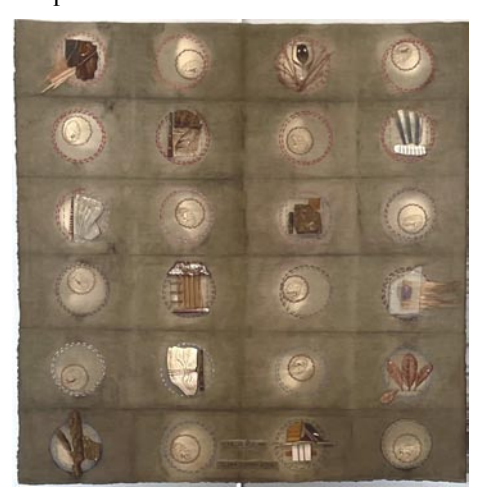
"Life is Round" by Susan Livingston

found objects she's integrated and stitched into acquired and rendered fabric. She has undertaken this with the competencies that only a mastery of needlework and imagination could accomplish. Life is Round (2023), which could be described as the work that inspired the title of the exhibition, gives new meaning to the term "work of art," through its intricate patterns of illustrations. The magnetism evoked by its stitching, embracing of found and treasured objects narrate the meaning of life as Livingston perceives it in this period of her life.