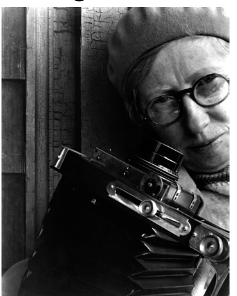
Imogen Cunningham (1883–1976) "Self-Portrait with Camera", late 1920s, silver gelatin print.