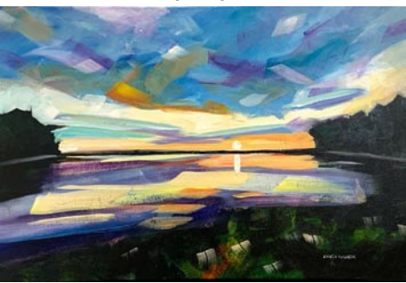
Work by Chris Wagner

Carolina Creations Fine Art and Contemporary Craft Gallery, 317-A Pollock Street, New Bern. NC. Ongoing - Featuring fine art and contemporary crafts including pottery, paintings, glass, sculpture, and wood by over 300 of the countries top artists. Hours: Mon.-Sat., 10am-6-pm, & Sun., 11am-3pm. Contact: 252/633-4369 or at (www.carolinacreations.com).