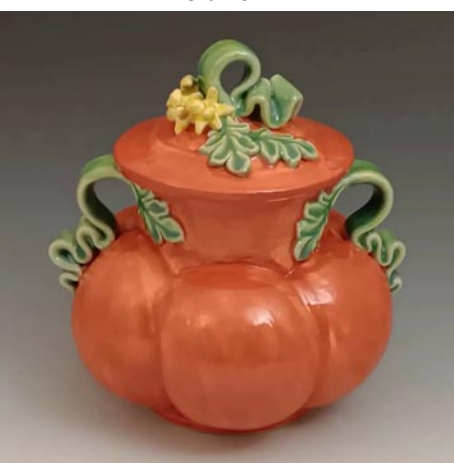
Work from Turtle Island Pottery

Turtle Island Pottery, 2782 Bat Cave Road, Old Fort. Ongoing - Featuring handmade pottery by Maggie and Freeman Jones, who create one of a kind, functional, decorative stoneware items. From cups to umbrella stands, mirror frames and clocks. Sculptural and inspired by nature, many forms are reminiscent of antique pottery from the arts and crafts movement and art nouveau styles. Hours: Showroom open most Saturdays, call ahead for any day of the week. Contact: 828/669-2713 or at (www.Turtleislandpottery.com).