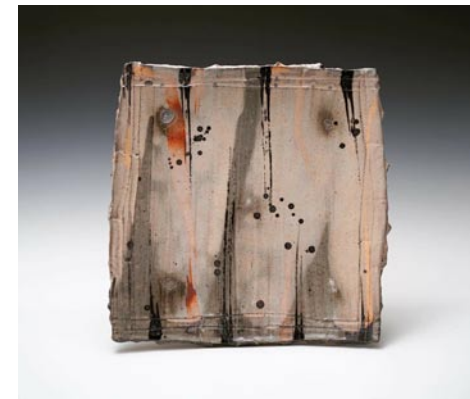
Work by Takuro Shibata

Stuempfle Pottery, 1224 Dover Church Rd., Seagrove. Ongoing - Featuring pottery with expressive shapes and natural surfaces by David Stuempfle. Hours: during kiln openings and by appt. Contact: 910/464-2689 or at (www. stuempflepottery.com).