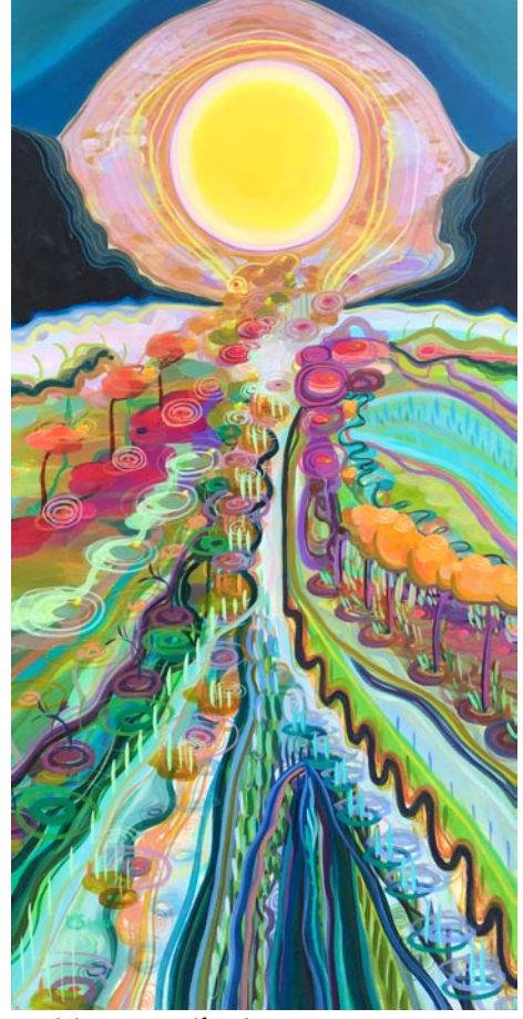
Work by Lisa M. Shimko

Upstairs Artspace maintains three gallery spaces totaling approximately 3000