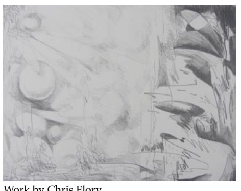
Work by Chris Flory 1995.

The works in the All Fall Down exhibition are all graphite on paper, drawn in 2020. Most are about the anxiety and frustration which Flory has been experiencing in COVID times. The "Breath" series is loosely based on some pastel drawings from Page 24 - Carolina Arts, April 2021