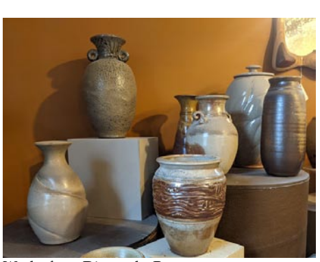
Works from Dirtworks Pottery buying beautifully created, handmade items to take home and enjoy.

Spring has always been a time for renewal and awakening in Seagrove, and this year shops are again opening their doors at the same time to celebrate Spring. This special 13th annual event is a self-guided tour of individual pottery galleries, studios, and workshops in the Handmade Pottery Capital of the USA. At participating shops located in the downtown center and throughout the countryside, visitors can go behind the scenes to experience the pottery-making process first hand and meet the artists before