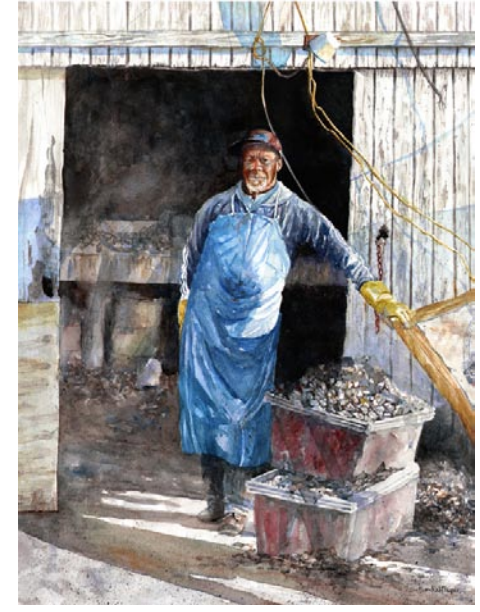
Work by Sandra Roper

This year's Art Market will have works in the following media on site: oil, acrylic, watercolor, mixed media 2-D & 3-D, sculpture, photography, pastel, ceramics,