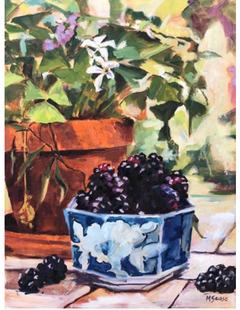
Work by Murray Sease

In addition to selling their original works, artists will also be competing for $5,000 in prizes.