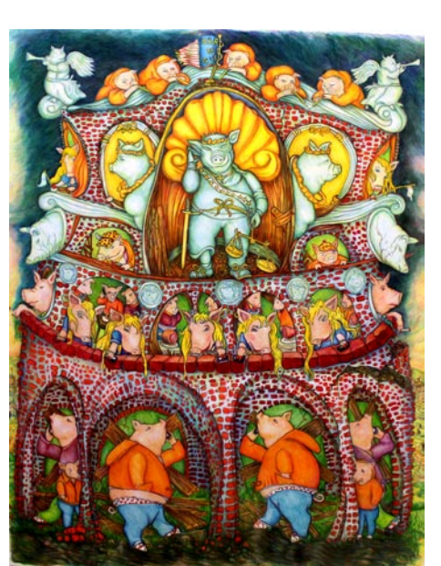
'You've Reached Justice" by Pauline Dove

Follow us on Instagram and Facebook at Central Piedmont Arts and our blog at (http://blogs.cpcc.edu/cpccartgalleries/). For further information check our NC Institutional Gallery listings or contact