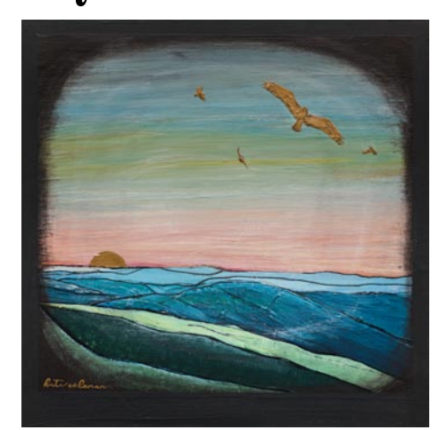
Work by Kate Coleman

Defining them by more than simple appearance, Coleman goes further by layering information, sourced by vintage books and maps, onto each specific piece. She searches used bookstores to find vintage books on birds and nature, and using the pages to apply visual texture to her paints, she applies more information specifically to each piece. The result is a very unique combination of visual texture and defining text, which presents a unique work. Her painted portraits of birds and nature are completed in acrylic paint on wood