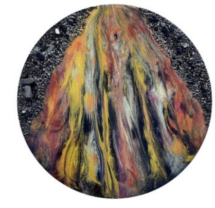
Work by Robyn Crawford

For further information check our SC Institutional Gallery listings or visit (artistscollectivespartanburg.org).