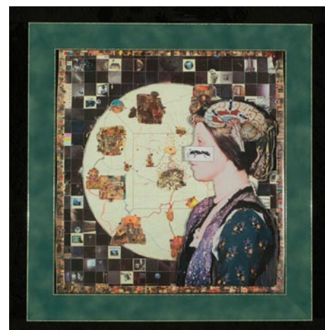
Square collage by Aldwyth. Dark green border around a square collage. Inside the border is a black square with an off-white circle in the center. Various cut out images and words are scattered on the paper. A woman in profile faces left. A picture of an ant covers her nose. Inhaling the Spore, 2015. Collage, 12 1/2 x 12 3/4", Collection of Steve and Cheryl Keller.

This retrospective spans nearly seventy years of Aldwyth's work, beginning with photography and moving through experimental painting, assemblage, and collage while touching on personal themes and fascinations that have remained remarkably consistent throughout her career. A tireless