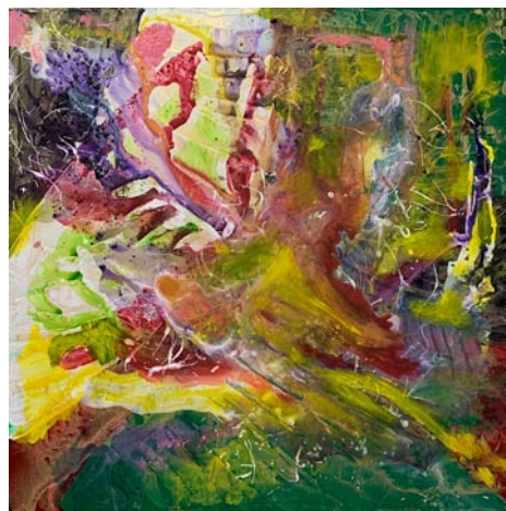
Work by Eric Saunders

Eric Saunders' work is a blend of abstract natural landscapes and digitally altered images. "In the past year I have re-involved myself with making composite images by combining elements of two or more photographs into one image." Saunders often uses this technique to make whimsical combinations of elements that ultimately fit together in a different way than one might expect from looking at the original images. "Sometimes odd combinations actually present themselves in the original image" he