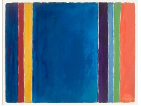
Alma Thomas (1891–1978), "Blue Ground Stripe", 1971. Acrylic and watercolor on paper, 22 1/2 x 29 7/8 inches. The Johnson Collection, Spartanburg, SC.

tion allows us to consider the artistic innovations of the 20th century - from Cubistinspired still lifes to fully abstract and conceptual works - through the unique lens of women artists with ties to our region," says CMA Curator Michael Neumeister. For further information visit (columbiamuseum. org).