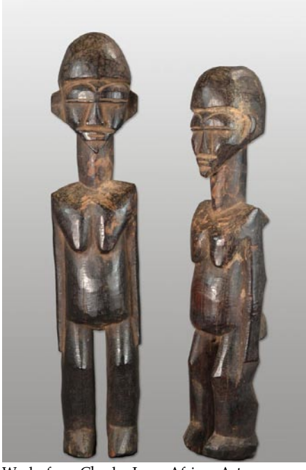
Works from Charles Jones African Art

Bottega Art & Wine Gallery, 723 N. 4th Street, Wilmington. Ongoing - Featuring works by regional and international artists in a variety of media. Hours: Tue.-Wed., 1-10pm and Thur-Sat., 1pm-midnight. Contact: 910/399-4872 or at (www.bottegagallery.com).