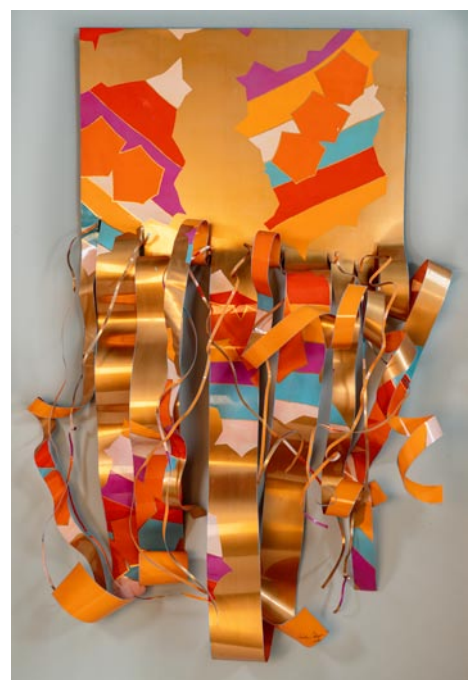
Large wall hanging by Dorothy Gillespie, on view at the Art in Bloom Gallery in Wilmington.

Dorothy Gillespie's large sculptures are part of the permanent art collection at Thalian Hall Center for the Performing Arts. "Beanstalk: Colorfalls I," a 40-foot enamel-on-aluminum sculpture is on display in the lobby. Dorothy Gillespie created the sculpture in 1989 for the Artluminum Exhibition at La Maison Alcan, Montreal Canada. On Mar. 2, 1990, the sculpture was re-installed for the opening