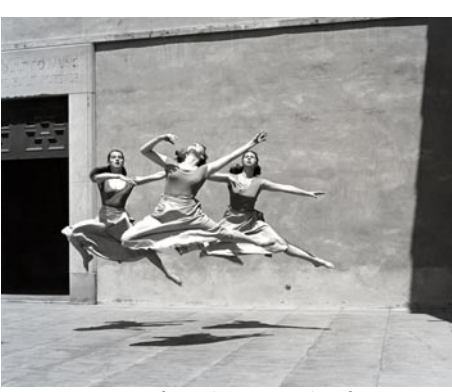
Imogen Cunningham (1883–1976) "Three Dancers", Mills College, 1930, silver gelatin print.