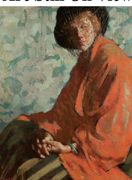
"Jade" 1918, Gertrude Fiske, Oil on canvas. 29 3/4 x 23 3/4 in., National Academy of Design, New York, NY

The Columbia Museum of Art in Columbia, SC, is presenting Interior Lives: Modern American Spaces, 1890-1945, on view through May 12, 2024. Through the lenses of interior scenes and material culture, Interior Lives explores the ways everyday Americans lived, worked, played, and evolved their identities in the first half of the 20th century. Homes, workplaces, and the spaces between were newly envisioned in response to socioeconomic and technological shifts. American artists, many of whom continued to work in a representational style, bore witness to the inception of a modern world and interpreted it as it manifested before them. The works on view in this exhibition - primarily portraits, genre scenes, and still lifes - are often modest in scale and humble in subject yet penetrating in their cultural and psychological implications. For further information call the Museum at 803/799-2810 or visit (www.columbiamuseum.org).