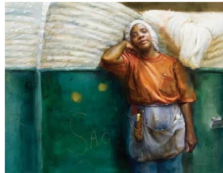
Mary Whyte, "Spinner" 2007, watercolor on paper @MaryWhyteArtist

The Shop at GCCA - In celebration of our eighth anniversary, Greenville Center for Creative Arts is thrilled to announce the opening of our official gift shop! As another opportunity for GCCA to support local artists, visitors can shop for consigned artworks from Greenville-based artists including prints, small originals, jewelry, pottery, and more! The Shop at GCCA will also have novelty merchandise for sale so you can show your love for Greenville arts everywhere you go! Ongoing - Home to 16 studio artists. Hours: Wed.-Fri., 1-5pm. Contact: call 864/735-3948 or at ( www.artcentergreenville.org ).