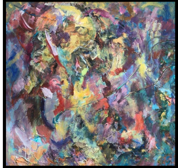
Painting by Corrie McCallum