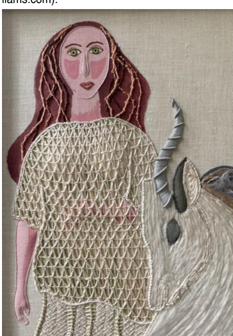
"Self Portrait" by Susan Livingston

Cecil Williams Civil Rights Museum, 1865 Lake Drive, Orangeburg. Ongoing - Established in 2019, the exquisite ultra-modern facility displays 1000 images of the Civil Rights Movement, but from the perspective of The Epochal South Carolina Events That Changed America. The massive archives comprise the largest collection of images of this type among all museums in the United States; including the Atlanta based High Museum which archives 300 images. The images were created by the founder, Cecil Williams, who began photography at age 9 and covered almost all historically significant events in South Carolina; from 1950 Briggs v. Elliot in Summerton, thru the 1969 Charleston Hospital Workers' Strike...and Beyond. From 1955 through 1969, Williams was a freelance journalist for "JET" magazine. His images have appeared in thousands of magazines, newspapers, historical publications, and motion picture productions. The museum design itself is part of the founders' DNA because; upon graduating from high school, Williams wanted to attend Clemson University to study architecture but denied because of his race. He then purchased a drafting board and through the years, designed three residences; including one featured in "EBONY", and the museum's design which has evolved into a living history facility. Hours: call ahead for hours. Contact: call 803-531-1662 or at (www.cecilwilliams.com).