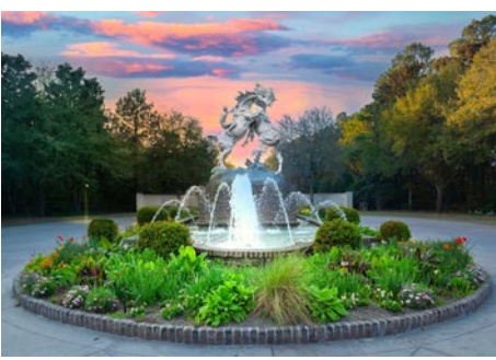
View of entrance into Brookgreen Gardens