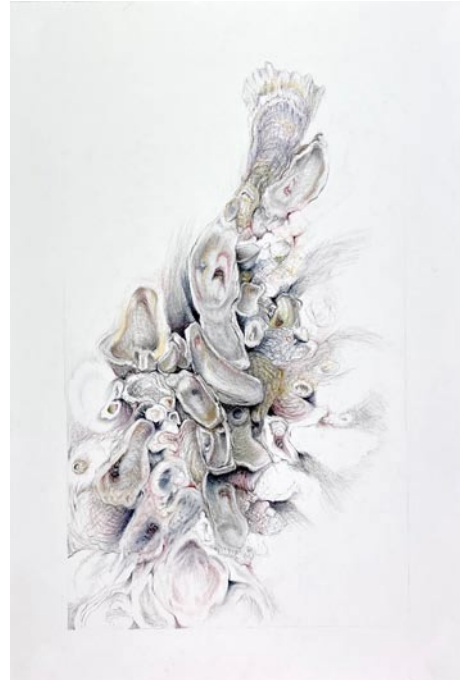
Work by Yvette Dede

Park Circle Gallery, formerly the Olde Village Community Building, 4820 Jenkins Avenue, in the bustling Park Circle neighborhood of North Charleston. Apr. 3 - 27 - "Air ~2," featuring mixed media works by Lynne Riding. A recep-