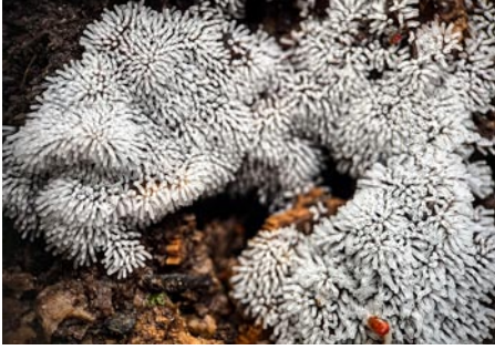
Work by Jax Gaglianese-Woody

King Street Art Collective, Watauga Ars Council, 585 West King Street, (above Doe Ridge Pottery) Boone. Ongoing - A gallery and interactive art space with changing exhibits and activities celebrating the arts. Hours: Thur., 11am-5pm; Fri.-Sat., 10am-6pm; and Sun., 10am-2pm. Contact: 828-264-1789 or at (https://www.watauga-arts.org/kingstreetart. html#/).