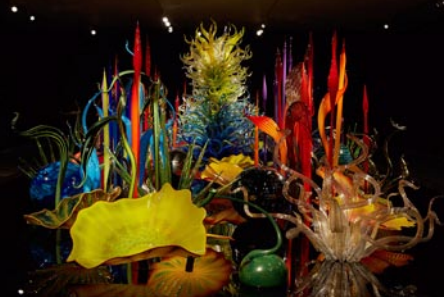
Chihuly at Biltmore

YMI Gallery, YMI Cultural Center, 39 S. Market Street @ Eagle Street, Asheville. Ongoing - "In the Spirit of Africa". Featuring traditional and contemporary African masks, figurative woodcarvings, beadwork, jewelry, and textiles. Discover the purpose of mask and sculptures, which reflect African ancestral heritage and learn to appreciate symbolism and abstraction in African art. YMI Conference Room, Ongoing - "Forebears & Trailblazers: Asheville's African American Leaders, 1800s - 1900s". The permanent exhibit offers a pictorial history of African-Americans from throughout Western North Carolina. Photographs of both influential and everyday people create a panorama of the variety of life among blacks in the mountain region. Here are the young and old, the prominent and the unknown, the men and women who helped create our city's life. YMI Drugstore Gallery, Ongoing - "Mirrors of Hope and Dignity". A moving and powerful collection of drawings by the renowned African-American artist Charles W. White. Entry, Ongoing - "George Vanderbilt's Young Men's Institute, 1892-Present". Admission: Yes. Hours: Tue.-Fri., 10am-5pm. Contact: 828/252-4614.