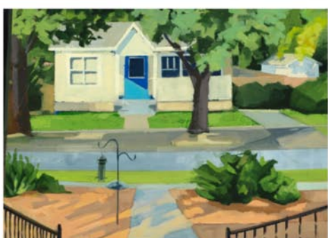
View From My Porch / Jones-Carter Gallery, Lake City SC / April 26 - May 4