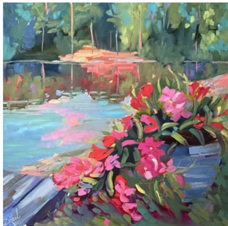
Work by Donna Heil

- The gallery represents artists from all regions of the United States, Argentina and Spain, exhibiting paintings, prints, and sculpture. The gallery features solo and group exhibitions as well as consulting services for individual collectors, corporations and museums. Hours: Mon. - Sat., 10am-6pm. Contact: 704/365-3000 or at ( www.jeraldmelberg.com ).