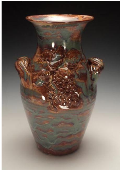
Work from Windsong Pottery

Williams Pottery , 2170 Dan Road, Robbins. Ongoing - Functional pottery in multi-colored as well as decorative glazes, Hours: Tue.-Sat., 10am-4pm. Contact: 910/464-2120.