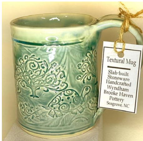
Work from Wyndham Brook Haven Pottery