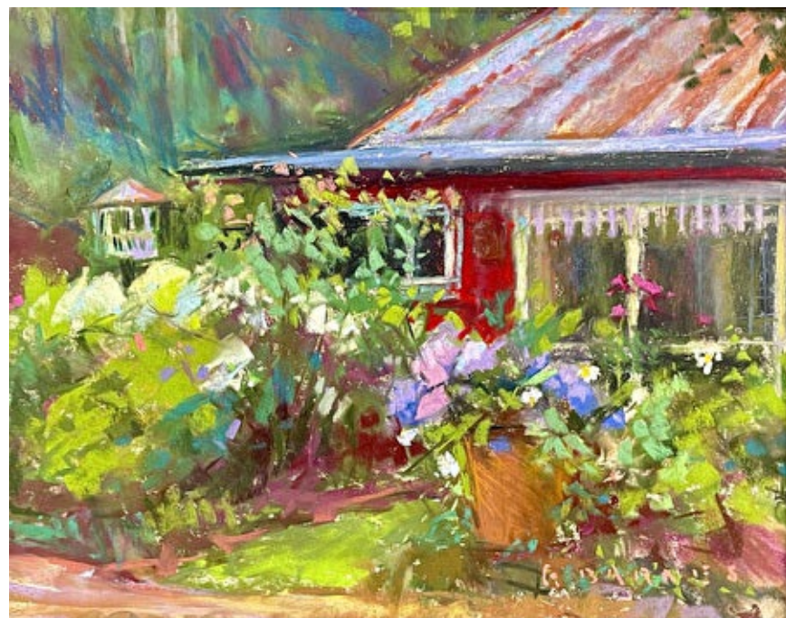
Greg Barnes, Victory Garden , Pastel, 11 x 14 inches

NEW MEMBERS ALWAYS WELCOME TO ENJOY THE BENEFITS OF JOINING IN OUR GROWING STATEWIDE FAMILY OF ARTISTS: