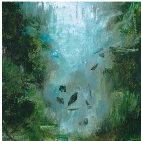
Work by Linda Fantuzzo

This collection features paintings on canvas and panel created in her Charleston studio. Once Seen , is a body of work influenced by the quality of light and the beauty of the surrounding landscape. Fantuzzo expresses “A landscape is more than seen; it is felt. And sometimes it is merely a glance that says it all. The things seen out of the corner of my eye often reveal the essence of that particular moment, and the atmospheric conditions secure my emotional response. Later, with memory and a brush loaded with paint, I endeavor to capture the experience of that site and moment in time.”