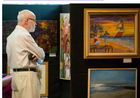
Arts Fest "Judged Art Exhibition & Competition"

Exhibit Hall A at the Charleston Area Convention Center will host the Arts Fest's Judged Art & Photography, South Carolina Palmetto Hands Fine Craft, and Tri-County Youth Art & High School Sculpture Competitions & Exhibitions during the entire run of the festival, May 4-8. Viewing hours are Wednesday, May 4, 6-8pm; Thursday-Saturday, May 5-7, 10am-6pm; and Sunday, May 8, noon-5pm. Award winners of the competitions will be acknowledged at 6:30pm during the Arts Fest Opening Celebration on Wednesday, May 4. The event, which takes place from 6-8pm, features food, music, and more, set among the hundreds of pieces of artwork on display. The Exhibition Encore on Sunday, May 8, from 2-5pm, serves as a closing reception, allow-