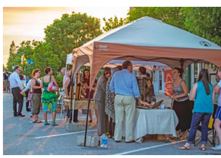
Arts Fest Block Party

Exhibit Hall A at the Charleston Area Convention Center will host the Arts Fest's Judged Art & Photography, South Carolina Palmetto Hands Fine Craft, and Tri-County Youth Art & High School Sculpture Competitions & Exhibitions during the entire run of the festival, May 4-8. Viewing hours are Wednesday, May 4, 6-8pm; Thursday-Saturday, May 5-7, 10am-6pm; and Sunday, May 8, noon-5pm. Award winners of the competitions will be acknowledged at 6:30pm during the Arts Fest Opening Celebration on Wednesday, May 4. The event, which takes place from 6-8pm, features food, music, and more, set among the hundreds of pieces of artwork on display. The Exhibition Encore on Sunday, May 8, from 2-5pm, serves as a closing reception, allow-