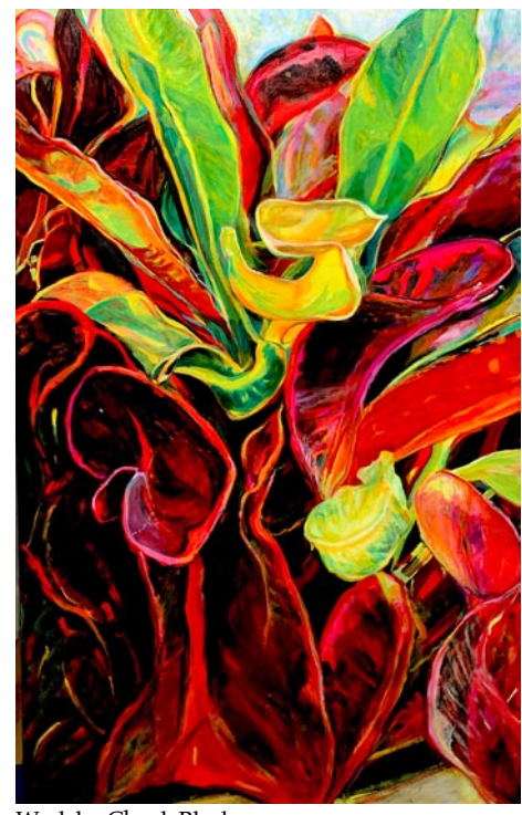
Work by Chuck Black

For further information check our SC Commercial Gallery listings, call the gallery