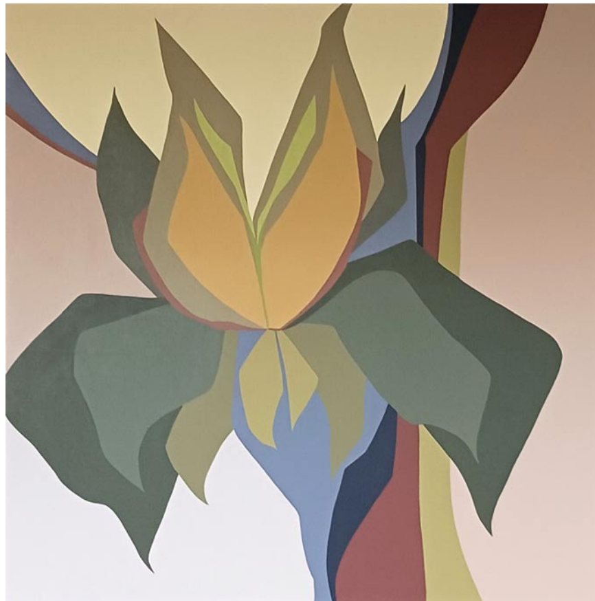
Crevice Climber , Acrylic on Canvas, 48 x 48 inches