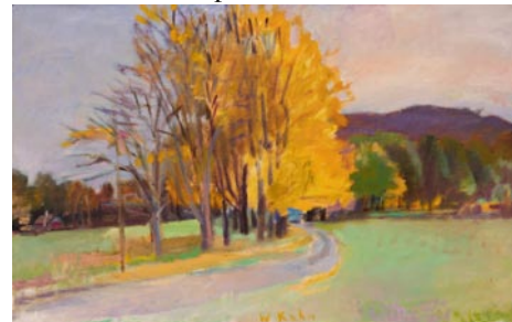
Work by Wolf Kahn