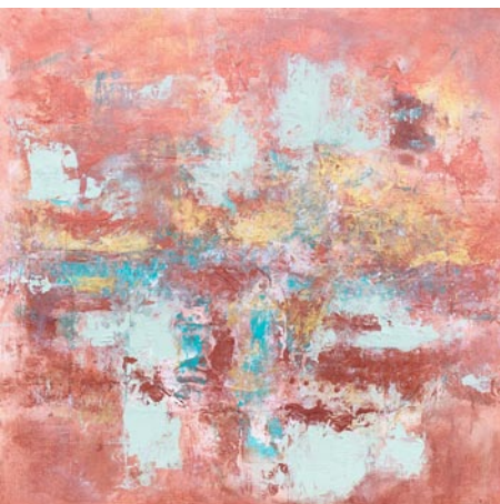
Work by Rose Cofield

Four Corners Art Gallery and Fine Framing, 1263 May River Rd., Historic District, Bluffton. Ongoing - Featuring works by 12 artists with an especially local flavor. The works are in acrylic, oil, mixed media, pen and ink, pottery and wire sculture. A real treat. We have a fine collection of custom picture frame mouldings and an experienced staff to work with anything from the unusual to the museum treated piece. Hours: Mon.-Fri., 10am-5:30pm & Sat., 11am-2pm. Contact: 843/757-8185.