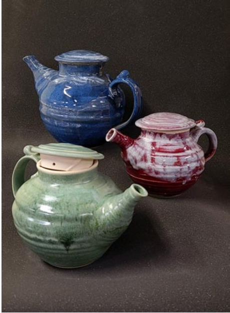
Works by Tom Dimond

He explains that lids for such things as urns or jars typically are secured with a high-temperature wax, “such as a letter