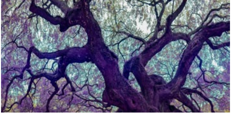
Work by Michael O’Neill

inspiration. By contrast, Hean was born and raised in Mayo, MD, along the Rhode River on the Chesapeake Bay’s western shore. Her artwork is grounded in drawing and amalgamates responses to landscape, which aim to transmit the power and impact of place. A significant inspiration in Hean’s work is found in watching storms and cloud structures. The drawings are a way to viscerally connect with the untouchable sky structures she daily observes, the immeasurable and compelling southwest architecture of canyons and rock, or the dramatic cliff edges of various seashores.