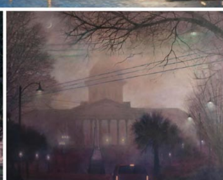
Works by Blue Sky

In 1975, Blue Sky completed TUN-NELVISION, a 50-by-75-foot mural on the north wall of a former bank at Marion and Taylor streets in Columbia, SC. The concept came to him in a dream, inspiring him to depict a realistic tunnel leading into a sunset. To execute this trompe-l'œil piece, Blue Sky constructed a one-man mobile scaffold and spent over a year painting, using about 25 gallons of exterior acrylic latex enamel and a brush attached to a six-foot stick. The mural's optical illusion of depth has captivated viewers since its unveiling, even garnering attention from People magazine in 1976. This year, we celebrate its 50th anniversary!