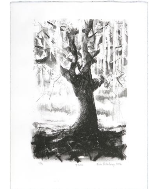
Work by Brian Rutenberg

Without the distraction of color, black and white art compels viewers to focus on