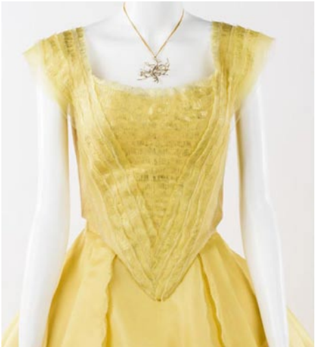
Belle's costume from "Beauty and the Beast"

The exhibition is organized into three Disney archetypes: heroes, villains, and the spaces between - a category reserved for the antiheroes whose fascinating journeys make them among some of Disney’s most complex characters. Here, guests can get an up-close look at the artistry on display in some of the iconic costumes of Disney live-action characters such as Mary Poppins from Mary Poppins Returns (2018), Queen Narissa from Enchanted (2007), and Jack Sparrow from Pirates of the Caribbean :