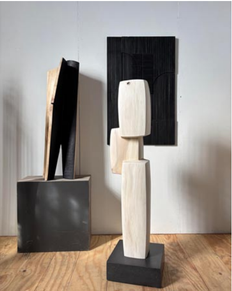
Works by Joel Urruty

Urruty’s sculptures have been exhibited and collected internationally, with works held in the permanent collections of the Asheville Art Museum, the Museum of