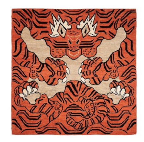
Ai Weiwei, "Tyger", 2022, Hand-knotted, handspun, hand-dyed natural Ghazni wool, 80 x 80in. Unique with two artist's proofs. Image © the artist and WWF-UK. Courtesy the artist and

Participating artists include: Nevin Aladağ (Germany, born Turkey), Azra Aksamija (United States, born Bosnia), Ali Cha'aban (Lebanon, born Kuwait), Sonya Clark (United States), Liselot Cobelens (Netherlands), Nicholas Galanin (United