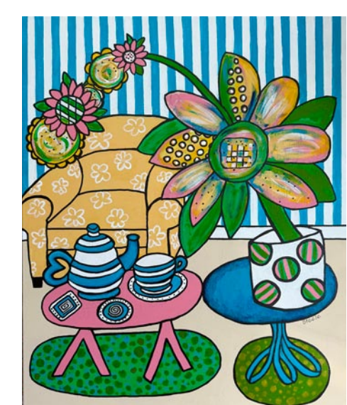
Work by Becky Steele

Located in coastal Brunswick County, NC, Sunset River Gallery caters to both