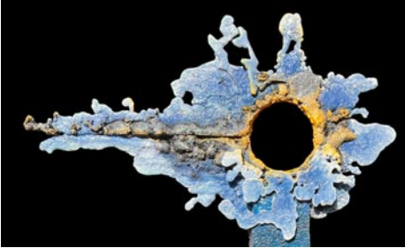
Work by Mike Waller

The Garden Art Gallery in Hillsborough, NC, will present the 30th Annual Art in the Garden Sculpture Exhibition 2025! An exhibition and sale of outdoor sculpture for the home and garden by 10 local and nationally recognized artists. This exhibit is a cooperative event in which all the artists contribute to cover expenses, and no commissions are taken. The gardens include acres of intimate garden settings, winding paths and open spaces. Outdoor sculptures are uniquely situated by the artists, in intimate settings with larger sculptures placed in the more open spaces. The artists will all be in attendance.