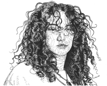
Work by CJ Monét

is the madness to the method; my love for method is the routine to the madness found in the art I create.” As a musician, Monét brings a deep sensitivity to the rhythm, tone, and imagery found in song lyrics. Each portrait is a tribute to the artist’s own words—woven into the contours of their face, the texture of their hair, the weight of their presence. The result is a visual reflection of the music itself: an image made literally out of the words that define it. By creating these lyric-based portraits, Monét seeks to honor the power of music to paint vivid pictures in the mind - and, in turn, offer viewers a chance to see the stories behind the sound. For further information check our NC Institutional Gallery listings, call the