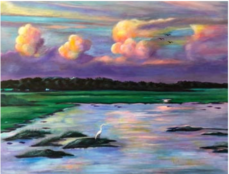
Work by Lynne Drake

Society of Bluffton Artists Gallery/Learning Center , 6 & 8 Church Street, corner of Calhoun and Church Street, Bluffton. May 4 - 31 - "Lowcountry Classics," featuring works by Lynne Drake. A reception will be held on May 8, from 4-6pm. This new collection captures the emotion, nostalgia, and natural beauty that define the Lowcountry. Ongoing - Featuring works in a variety of mediums by over 100 area artists, with all work moderately priced. Changing shows every six weeks. Hours: Mon.-Sat., 10am-5pm & Sun., 11:30am-3pm. Contact: 843/757-6586 or at ( www.sobagallery.com ).