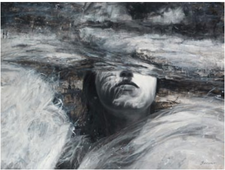
Work by Morgan Serreno East

in color, old and new, that continue East's exploration of water as both subject and symbol. "Humans continually seek comfort and healing in nature," East writes in her artist statement. "Water has always served as a central theme in my work - its quiet gentleness and immense power mirror the balance we seek in our daily lives."