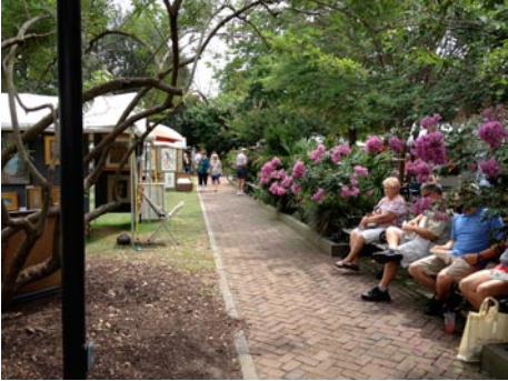
View of previous Outdoor Exhibition

Marion Square, at the intersection of Meeting, King and Calhoun Streets, is transformed into a beautiful open-air market as some of the finest and most creative local artists exhibit and sell their work. You can view original oils, pastels, watercolors, acrylics, encaustics, photography and more. Visitors have a unique opportunity to watch daily painting demonstrations and to personally connect with the artists who are on site for the exhibition's duration.