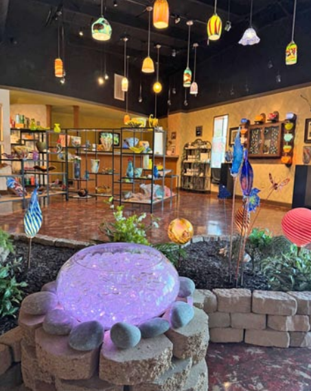
View inside One Eared Cow Glass

Noelle Brault Fine Art , 2305 Park Street, (historic Elmwood Park) Columbia. Ongoing - Noelle Brault is an impressionist artist who utilizes a unique blending of vibrant colors to capture the beautiful light and shadow found in South Carolina's Lowcountry and her native home of Columbia. Hours: by appt. only. Contact: 803/254-3284 or @noellebrault on Facebook.