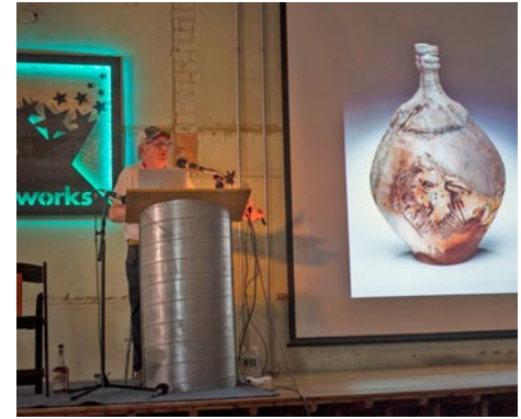
View of a previous Sustain: Woodfire NC conference at STARworks.

Seagrove Area Pottery Center (Not the NC Pottery Center), 122 E. Main St., Seagrove. Ongoing - The former museum organization was founded twenty-five years ago in Seagrove, and is dedicated to preserving and perpetuating the pottery tradition. We strive to impart to new generations the history of traditional pottery and an appreciation for its simple and elegant beauty. A display of area pottery is now offered in the old Seagrove grocery building. Hours: Mon.-Sat., 9:30am-3:30pm. Contact: 336/873-7887.