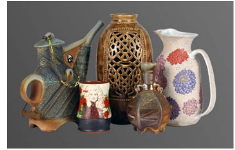
Works in the exhibit "Surface Stories" on view at the NC Pottery Center in Seagrove, NC

Carolina Bronze Sculpture Garden, Carolina Bronze, 6108 Maple Springs Road, Seagrove. Ongoing - The Carolina Bronze Sculpture Garden is a natural and landscaped area overlooking a beautiful 1.25 acre pond. A walking trail loops around the pond with benches and a picnic area along the trail. The Sculpture Garden collection consists of donated and loaned sculptures from emerging and established artists working in all 3D media suitable for the outdoors. There are currently 19 sculptures installed around the pond. The landscaped and natural areas have a focus on NC native plants and trees. As an extension of this park, a sculpture is installed in the downtown area of Seagrove. Hours: Mon.-Fri., 8:30am-4pm. Contact: 336/873-8291 or at (www.cbsculpturegarden.com).