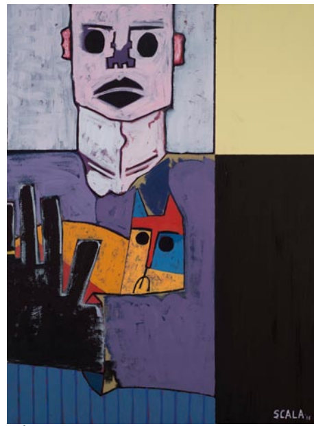
"The Keeper" by Peter Scala

continued above on next column to the right