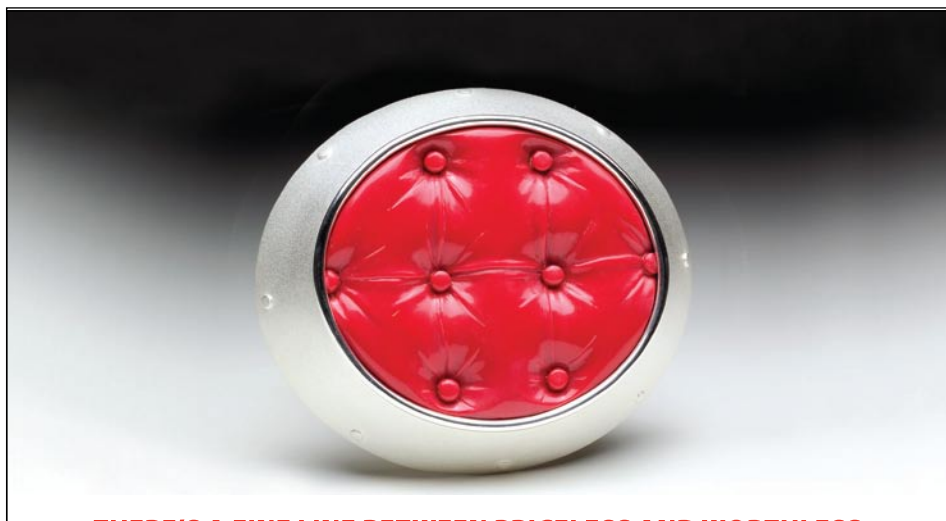
THERE'S A FINE LINE BETWEEN PRICELESS AND WORTHLESS

Every once in a while I feel like just filling one of these spaces with a kind on nothingness. You know as if nobody reads what's in these spaces anyway. So if one time I said something like the first person to read this and send me an e-mail to (info@carolinaarts.com) during the month of June, they'll get a free 1/4 ad in our July 2019 issue or the month that is most useful for them. But who reads these space fillers anyway? Not many I bet.