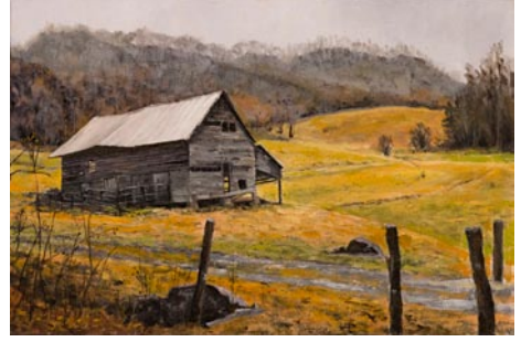
Work by Mark Henry

venues including HomeGrown Café, Fig Bistro, Green Sage Café, and Chupacabra Latin Café as well as popular Madison County restaurants (Sweet Monkey Bakery & Café and Stackhouse Restaurant). There will be sweets, free wine and beer and music. There will also be opportunities to meet and mingle with the artists and members of the Barn Alliance. This is a ticketed event for $45 per person, and tickets can be purchased by calling 828/380-9146 or at (https://appalachianbarns.org/) or at the continued on Page 20