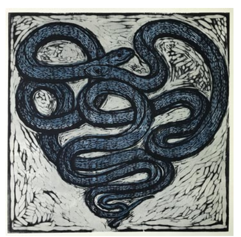
Work by Kent Ambler

American Folk Art regularly has artwork featuring mysterious snakes and has created an entire show devoted to them. Sculptural forms carved out of wood, pottery & ceramic works, paintings & woodblock prints will be included in the show. The work of folk and self-taught artists is rooted in personal experience, and encounters with snakes are experiences not soon forgotten, from awesome to fearful, it is a subject often explored. While creating a show devoted to snakes will perhaps be unsettling to some, without the surprise element of encountering one in the wild, perhaps the beauty, the textural nuances and real charm of these remarkable creatures may evolve a few attitudes towards fascination or even appreciation.