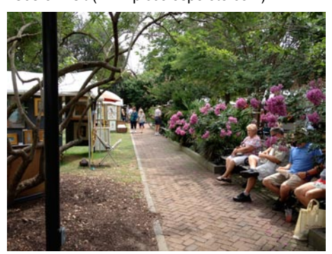
Piccolo Spoleto Outdoor Art Exhibition at Marion Square Park

Circular Congregational Church, Upper Lance Hall, 150 Meeting Street, Charleston. Through June 9 - "Art of Recovery 2019 Exhibit," featuring an award-winning exhibit of over 100 original works that takes the viewer on a journey through the challenges and triumphs of the human experience. A Piccolo Spoleto Fevtival event. Hours: daily 11am-7pm. Contact: Call the Office of Cultural Affairs at 843/724-7305 or visit (www.piccolospoleto.com).