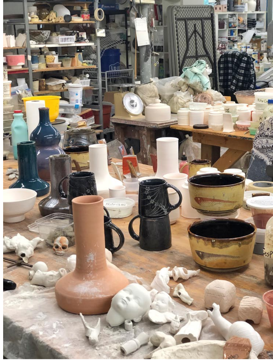
Bruce's ongoing experiments with sculptural collage using vintage molds and hand modeled elements are on the front corner of the table, and further in are slip trailed fish bone patterns on black finish mugs, and minnow images on Moka glazed bowls.