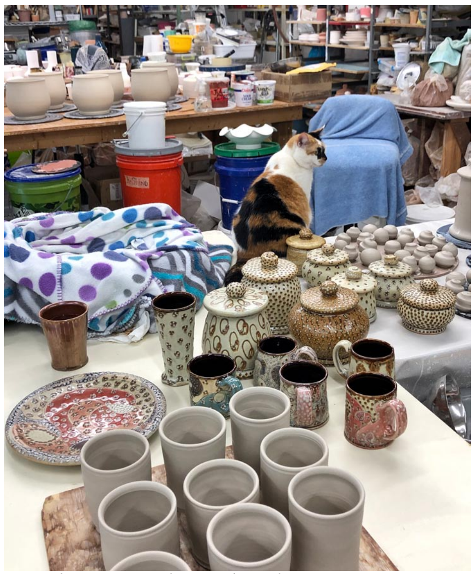
Koi surveys her realm after a nap on her corner of the table. She is extremely adept at causing minimal collateral damage if provided her own property in the studio. On the Samantha's table is a selection of her finished Moka glazed mugs, covered jars, and a plate with a pattern medley design. Right beside Koi are covered jar knobs freshly thrown and ready to be attached to the lid of covered jars.