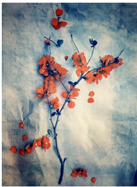
Work by Diana Bloomfield

cover image), and the North Carolina Literary Review, Bloomfield's art has been featured in the Pinhole Journal; The World Journal of Post-Factory Photography; Chinese Photography; Shadow & Light (including front cover image); Analog Forever Magazine (Issue 2, Summer 2020); Dodho Photography Magazine, and Silvershotz (including front cover image).