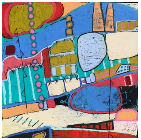
Work by Cindy Walton

When the COVID-19 lockdown period arrived in March of 2020, I found myself at home "limited" by place and workspace, however, without the limitation of a certain amount of time to create. Having been a painter most of my adult life, I found myself wanting to explore different ways of expressing myself beyond the abstractions of recent years such as "The Water Series". I began constructing assemblages of torn paintings on paper, repurposed by weaving, sewing, and gluing to create new painting surfaces. As the limitations of the