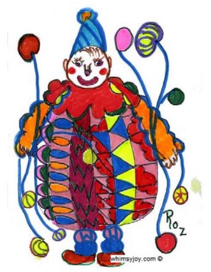
Check my website for new whimsies!